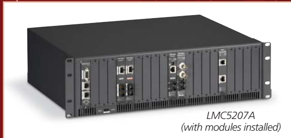
LMC5207A (with modules installed)

Once the chassis has an IP address assigned, use the iView software or another SNMP-compatible network management system, such as HP OpenView, to remotely configure, monitor, and manage the modules you install in the chassis. Program subnet masks and default gateways, create community strings (for both read-only and read/write access), configure traps—all within a password-protection process!