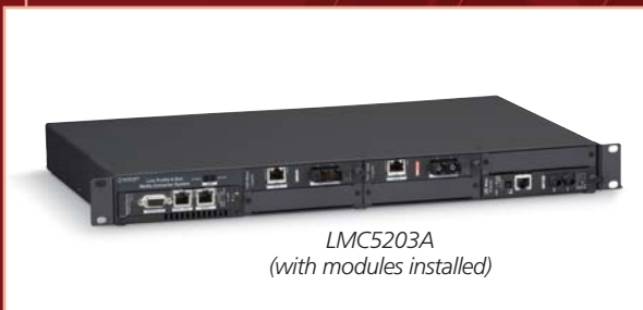
LMC5203A (with modules installed)