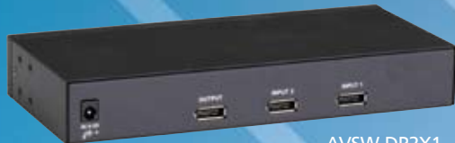
AVSW-DP2X1 (back view)