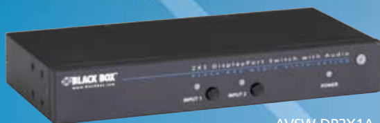
AVSW-DP2X1A (front view)