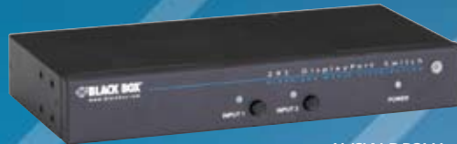
AVSW-DP2X1 (front view)