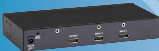
AVSW-DP2X1A (back view)

The diagram below shows the AVSW-DP4X1A connections.