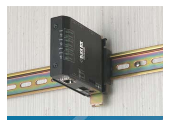
The DIN Rail Mounting Bracket (DIN-RAIL MC2) features a spring latch that enables you to quickly add or remove a module without using a screwdriver. Like the Media Converter Switches, the bracket is all metal, tough, and durable.