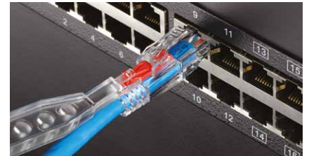
Pull the Locking Pin back and lift the Key to release.