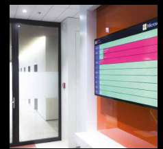
Publicly Accessible Lobbies