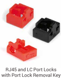
RJ45 and LC Port Locks with Port Lock Removal Key