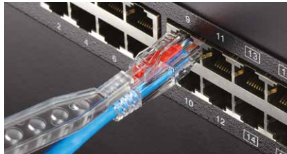
To unlock, insert the Key into the Pin until it clicks.