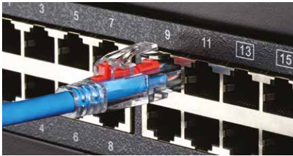
A locked cable with the Red Locking Pin.